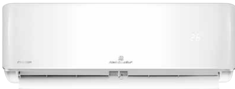
KSV50HRG, KSD50HRG, KSV70HRG, KSD70HRG, KSV80HRG, KSD80HRG