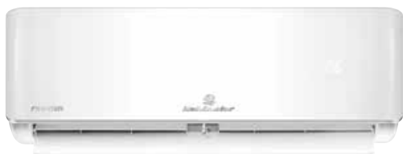
KSV25HRG, KSD25HRG, KSV35HRG, KSD35HRG